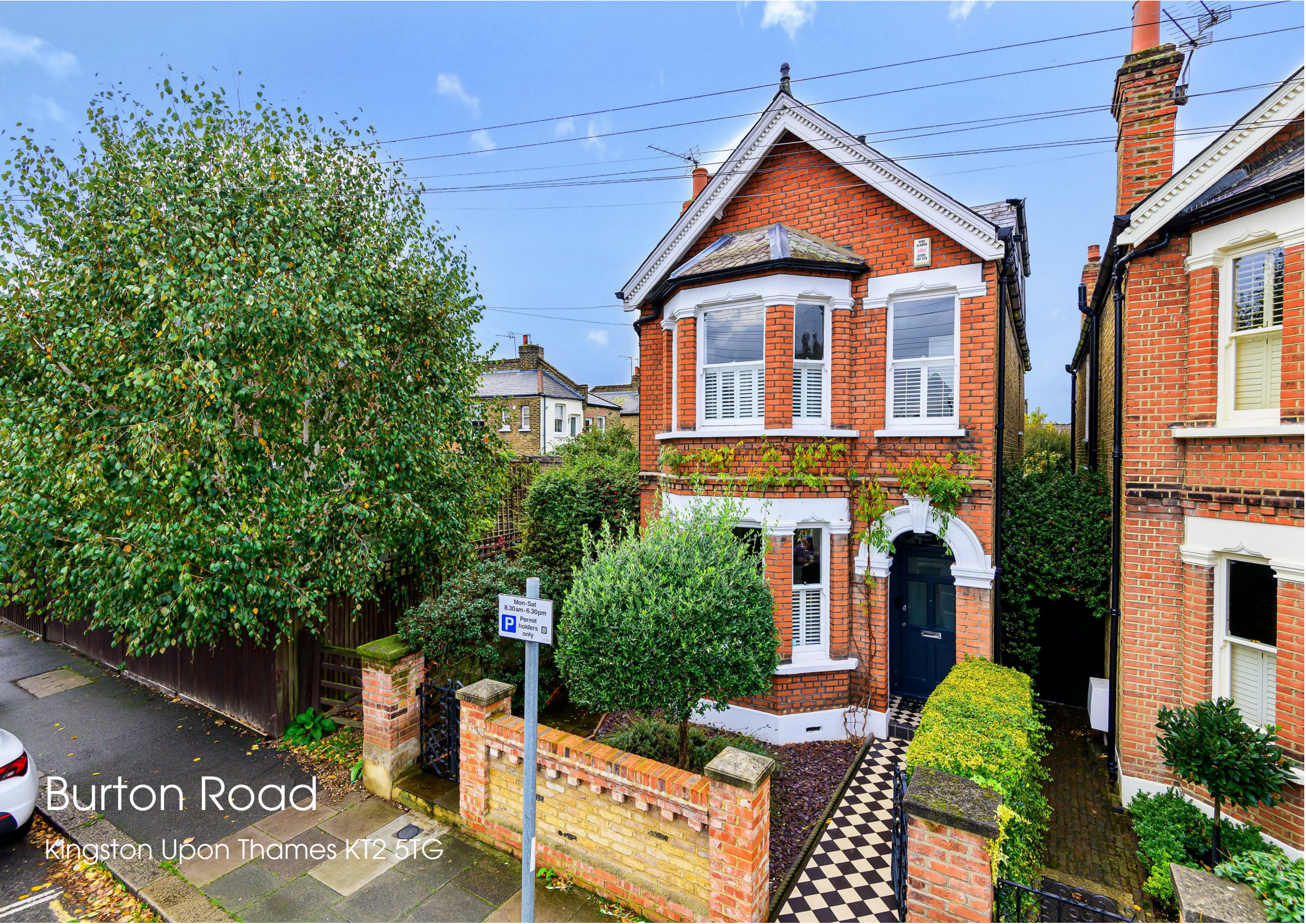
Burton Road Kingston upon Thames KT2 5TG